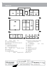
color logo in the exhibition programme of events at the space plan