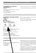
Logo in the catalogue